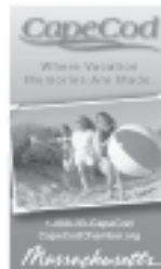
Spring '06 Print ad