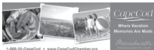
Spring '06 Billboard