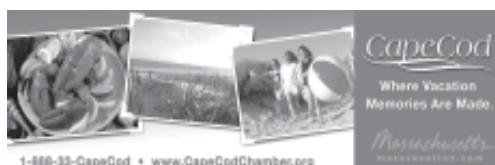
Spring '06 Billboard