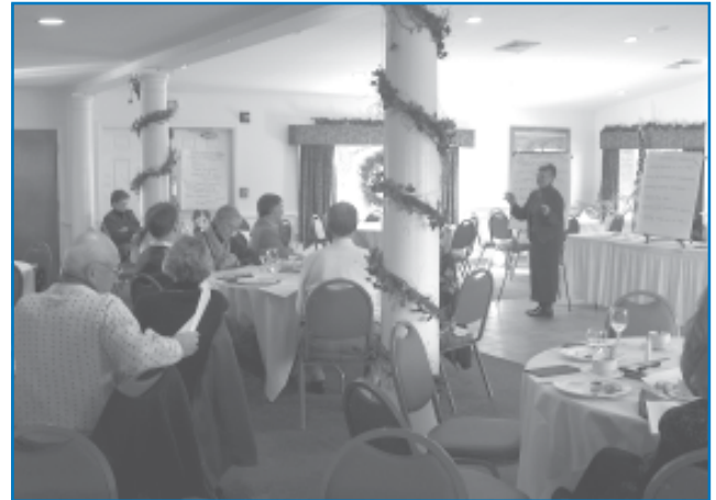
A representative group of Cape Cod Chamber members gathered at the Hyannis Golf Club on December 20 for a strategic planning session for the upcoming 3rd Annual BizWiz Conference & Marketplace, set for March 14, 2006. Register now online at www.eCapeChamber.com .

Register to attend online today at www.eCapeChamber.com ! Sponsors of BizWiz include Cape Cod Chamber, Coastal Community Capital, the county’s Cape Cod Economic Development Council, Eye Health Services and Cape Cod Times. Also supported by the 15 local Cape Cod Chamber of Commerce and Cape Business Magazine.